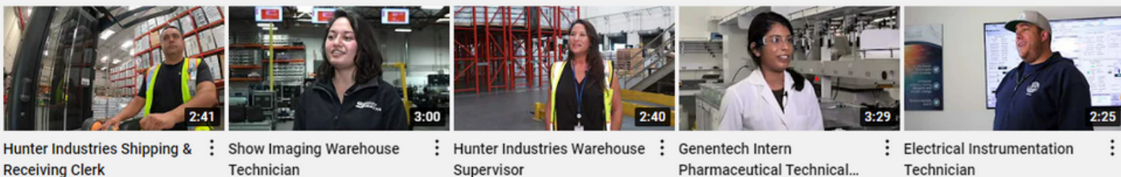
Hunter Industries Shipping & Receiving Clerk 2:41